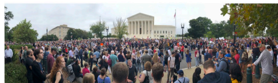
Fighting For Reproductive Rights