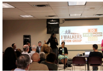
Democratic Party Support